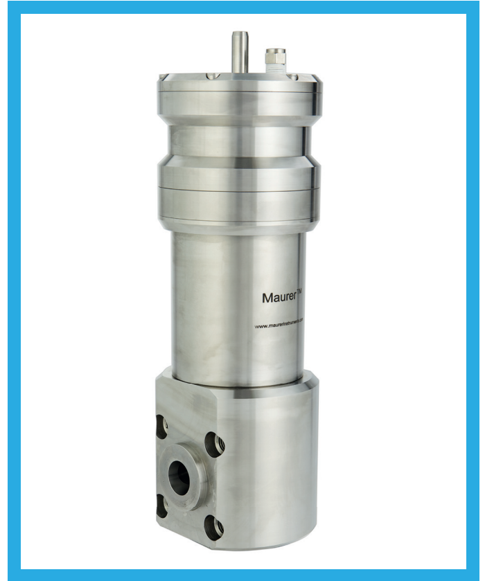
MCS31 Pneumatic Cell Sampler