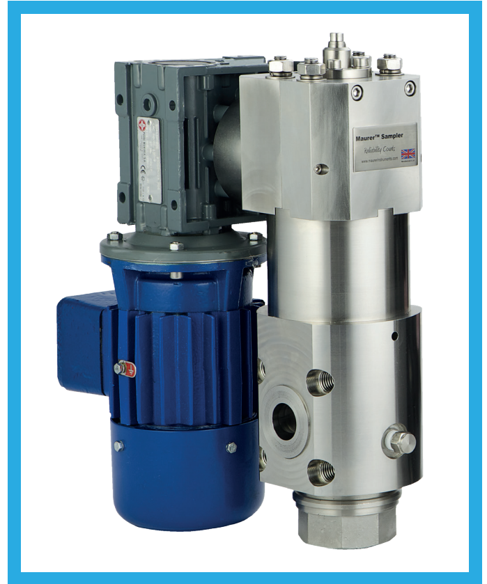
ES11 Electric Motor Driven Cell Sampler